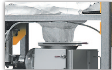
Iris Valve option