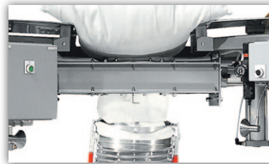
Pinch Valve option

Improve material discharge with optional pan utilizing rubber vibration dampers and ATEX-rated electric vibrator (not shown).